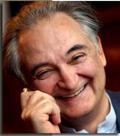
Jacques ATTALI, Economist, President of PlaNet Finance

Holder of PhD in Economics, Jacques Attali was graduated from Ecole Polytechnique, Ecole des Mines, Institut d'Etudes Politiques and Ecole Nationale de l'Administration.